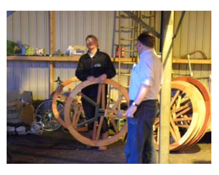
Seeking Divine guidance....?