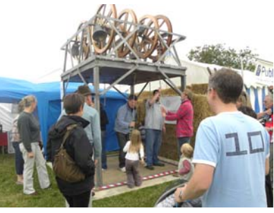
... and continues all day