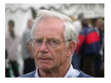
Hon Treas: argh, we've spent money!