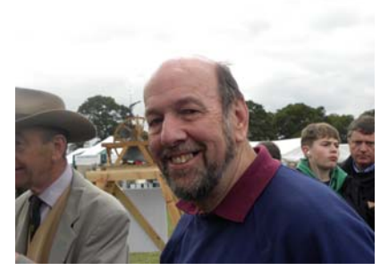
The Stand project manager