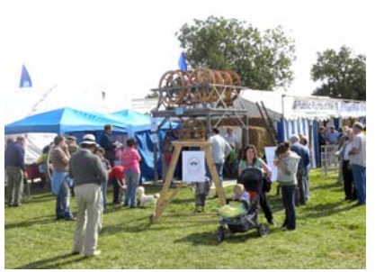
Interest hots up...