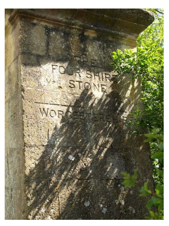
THE FOUR SHIRE STONE (The WORCESTERSHIRE face)