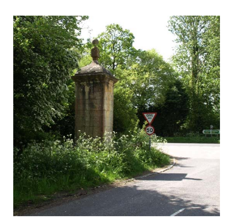
Note slight lean towards the Wolford road